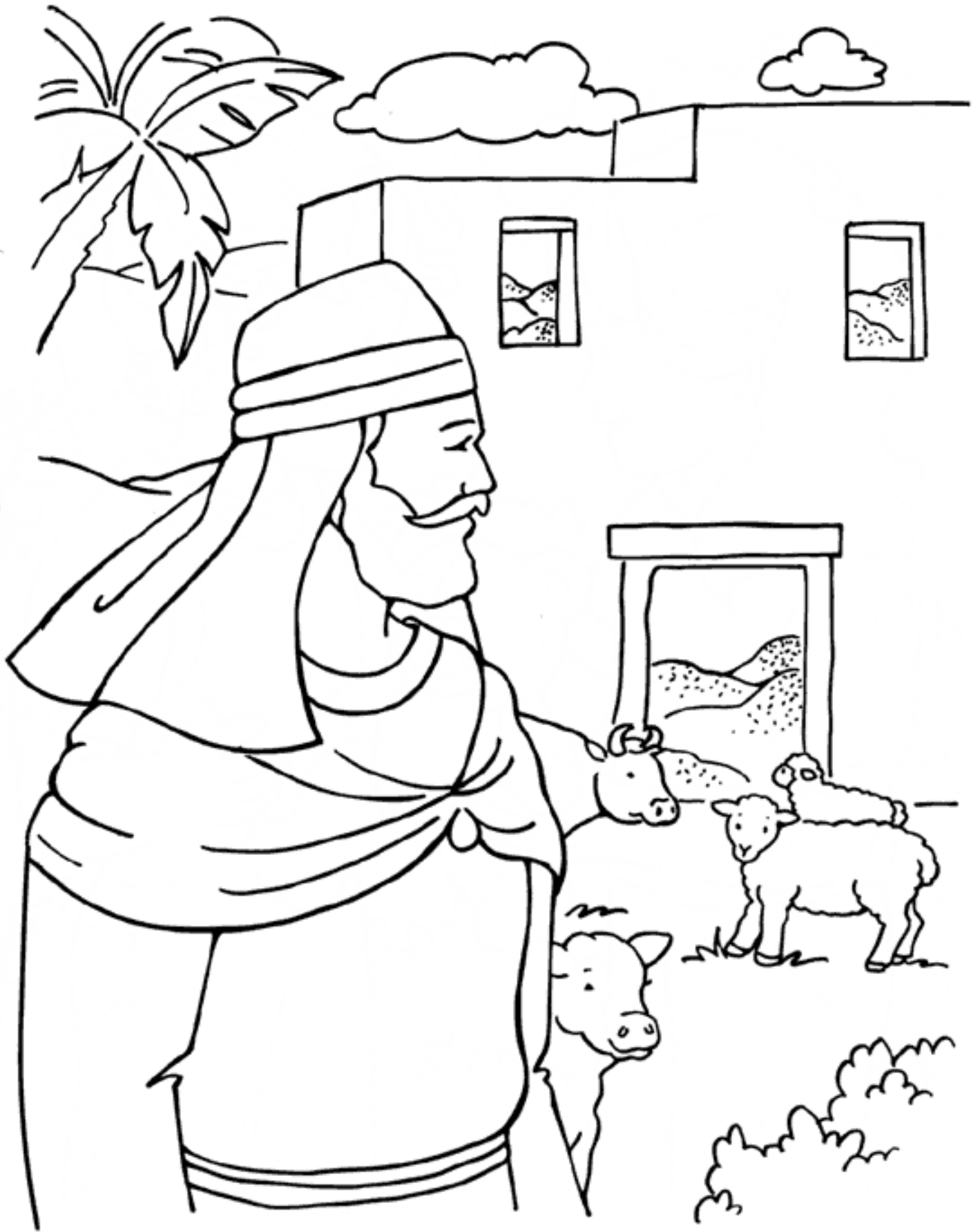
The Greedy Farmer Luke 12