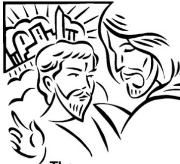
The Temptation of Jesus

Copyright © Sermons4Kids, Inc. May be reproduced for Ministry Use